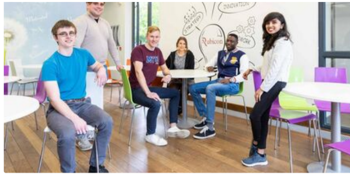
This year's cohort of twenty-one student entrepreneurs were chosen for the programme from over ninety student applicants.

The expansion of the programme was supported by funding won under the Innovation and Transformation Programme funded by the Higher Education Authority (HEA) in 2018. The expanded programme ensures that all higher education students in the partner universities have the opportunity to see if their business ideas and inventions are viable as commercial opportunities or social enterprises.